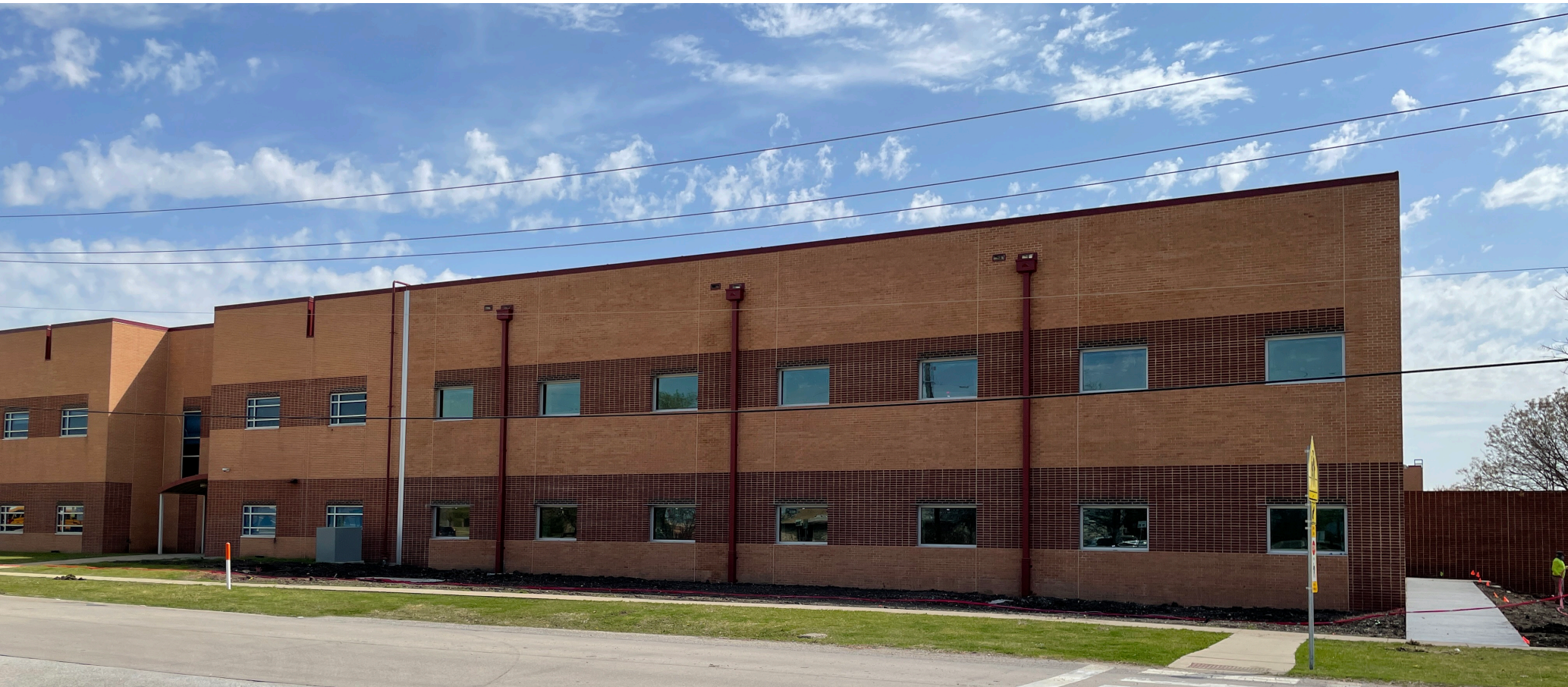
Medlin Middle School – Fine Arts Addition