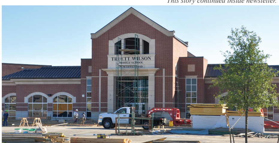
Approximately 615 students will attend the district's fifth middle school, Truett Wilson Middle School, located in the Sendera Ranch neighborhood. Construction crews put the finishing touches on the building during the summer in order to welcome students the first day of school, August 28.