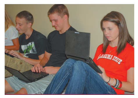
Northwest High School students explore their netbook during registration. During the past three years, the secondary student laptop initiative has proved successful in Northwest ISD.

For the fourth consecutive year, Northwest ISD will issue netbooks, or mini laptops, to students as part of its vision where every student is future ready: ready for college, ready for the workplace, global and ready for personal success.