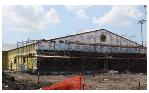
Samuel Beck Elementary School is one of three elementary schools to receive renovations this year. This new classroom wing, along with minor updates to the interior of the building, will be finished in time for the start of school, August 28.