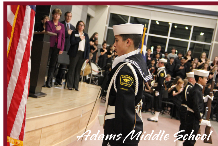
Adams Middle School